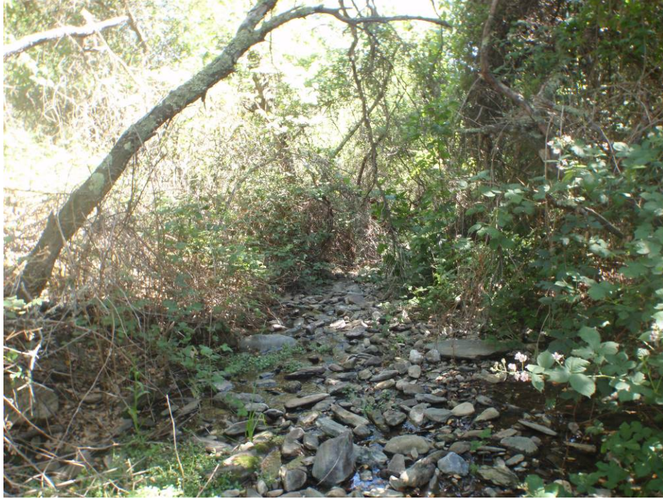
Photo 15. Kanaka Creek Downstream of the highway, multiple vertical layers of vegetation were present in horizontally diverse patches