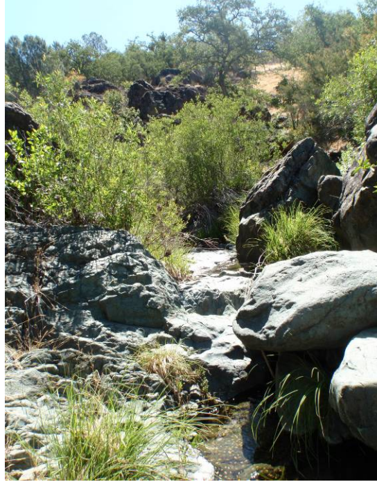
Photo 21. Drainage #8 The lower portion of the channel was comprised mainly of bedrock and boulders. Vegetation was limited and included red willows and small patches of naked sedge or stream orchid ( Epipactis gigantea ) that occurred in crevices between boulders