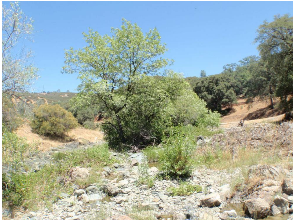
Photo 12. Hatch Creek Red willow, mule fat ( Baccharis salicifolia ), and spice bush were present between stretches of open, rocky banks and pools. Himalayan blackberry ( Rubus armeniacus ) was present on many of the banks under canopy of red willow or upland canyon live oaks ( Quercus chrysolepis )