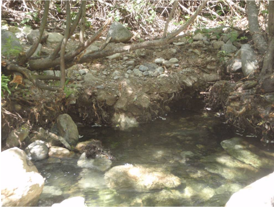
Photo 9. Moccasin Creek The creek is accessed frequently by fishermen, with trails throughout upland areas and into the riparian zone. The left bank just upstream of the discharge point had a short erosional area, where the dirt bank has collapsed; however the established root systems have stabilized the soil and prevented complete bank failure