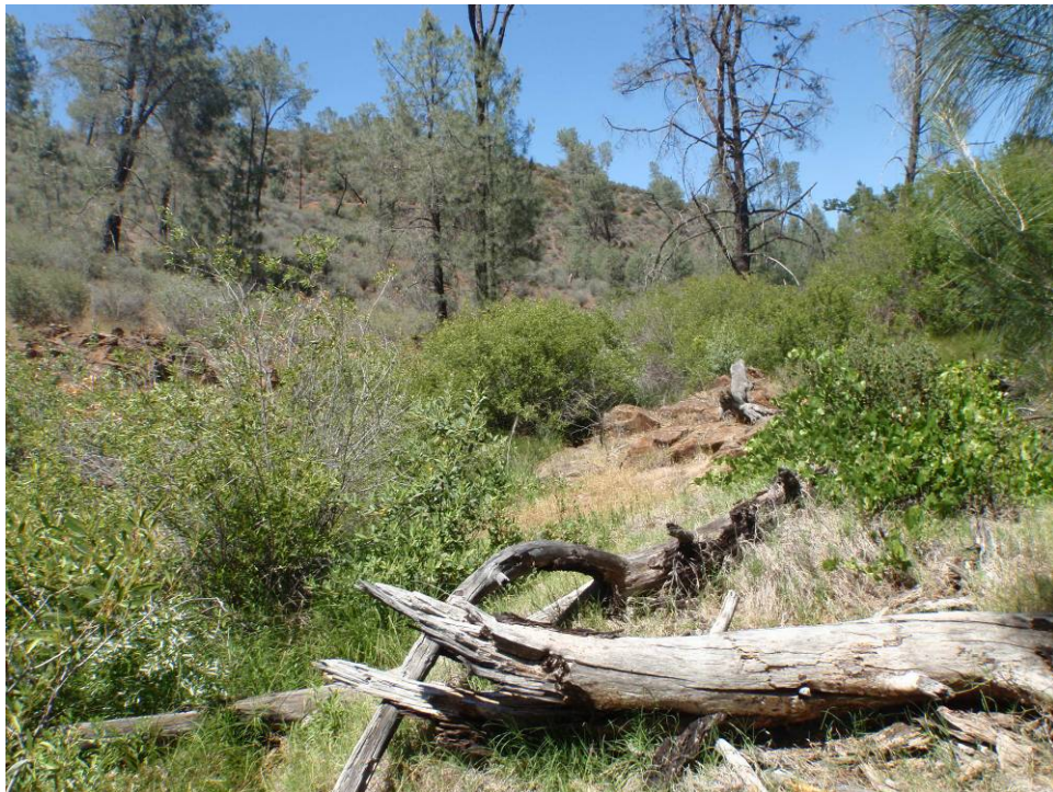
Photo 6. Poorman's Gulch Patches of red willow and spice bush ( Calycanthus occidentalis ) alternated with naked sedge hummocks and open bedrock, which occurred more frequently around pools located at the upstream end of the Assessment Area (AA) .