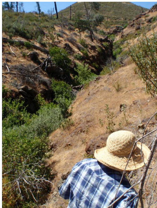
Photo 20. Drainage #7 Limited shrubs, such as buckeye ( Aesculus californica ), red willow, and spice bush grew from within the vertical-walled drainage, with the canopy just overtopping the banks of the channel