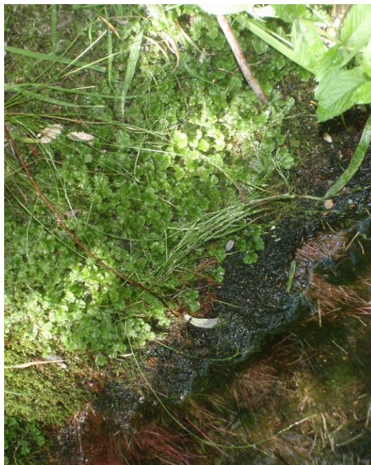
Photo 10. Moccasin Creek Exposed alder roots at the wetted edge, diverse aquatic vegetation, and abundant bryophytes on the banks indicated a healthy system with minimal fluctuation in flows.