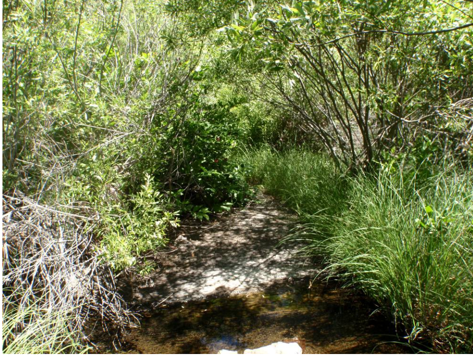
Photo 3. Sixbit Gulch A paved road crossed the channel near transect SG-06, which appears to be unused due to dense vegetation coverage. The road provides an opening in the dense riparian shrubs for sedge, springseep monkey flower ( Mimulus guttatus ) and Sonoma hedgenettle ( Stachys stricta ) to flourish