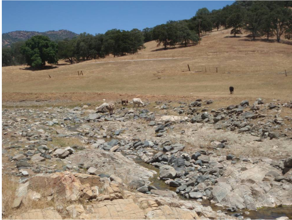
Photo 11. Hatch Creek Cattle grazing was present within Hatch Creek and surrounding upland areas