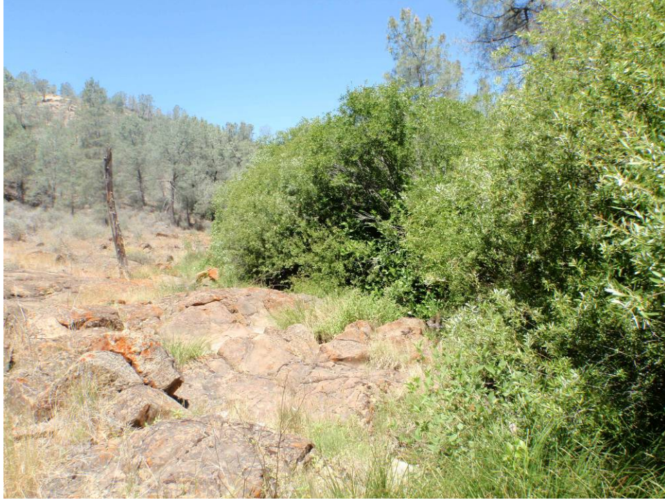
Photo 1. Sixbit Gulch Large bedrock and boulder outcrops occurred along the perimeter of the wetland in this moderately confined drainage.