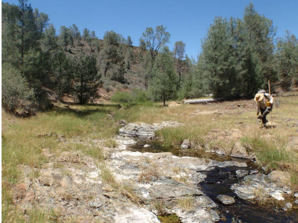
Photo 5. Poorman's Gulch Exposed bedrock supports perennial ryegrass ( Lolium perenne ), and annual beardgrass ( Polypogon monspeliensis ) at the perimeter.