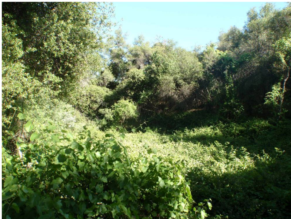
Photo 16. Kanaka Creek Upper portions of the creek had reduced species richness and horizontal complexity due to the dominance of Himalayan blackberry and fig ( Ficus carica ) dominance over the mid and tall layers of vegetation.