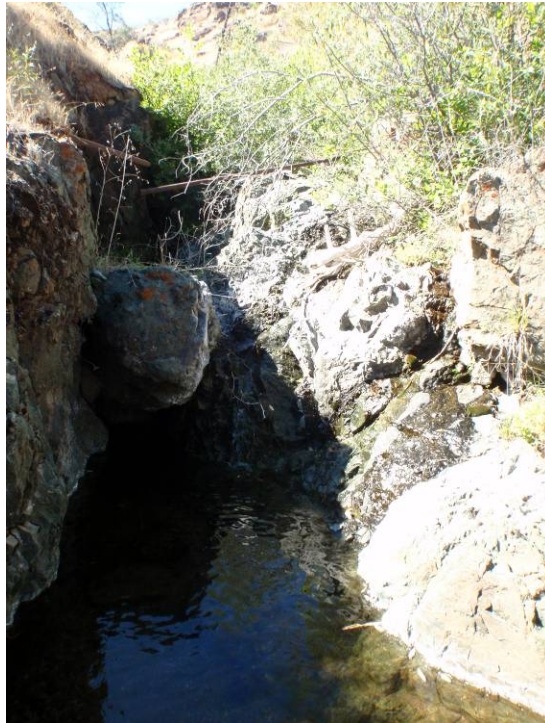
Photo 19. Drainage #7 The upland grasslands end abruptly at the edge of the drainage that has nearly vertical bedrock walls and bedrock floors