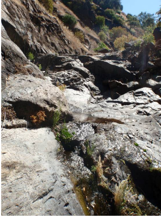
Photo 17. Deer Creek The majority of the channel was comprised of bedrock streambed and banks and supports very limited vegetation