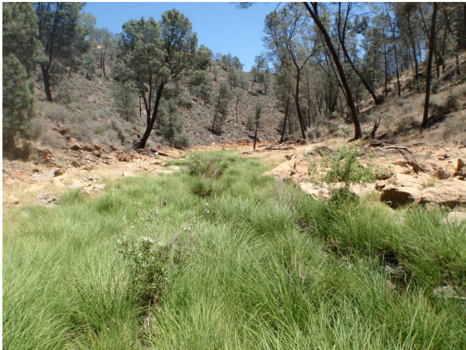
Photo 2. Sixbit Gulch Hummocks of naked sedge ( Carex nudata ) intermixed with Sonoma hedgenettle ( Stachys stricta ), springseep monkeyflower ( Mimulus guttatus ), and an occasional red willow ( Salix laevigata ).