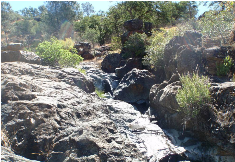
Photo 22. Drainage #8 The upper portion of Drainage #8 had a steep gradient with the streambed and banks comprised exclusively of bedrock and boulders. A series of falls, plunge-pools, chutes, and sheets formed the channel; intermittent red willows, spice bush, and buckeyes occurred in areas where sediment was present and at the channel's edge