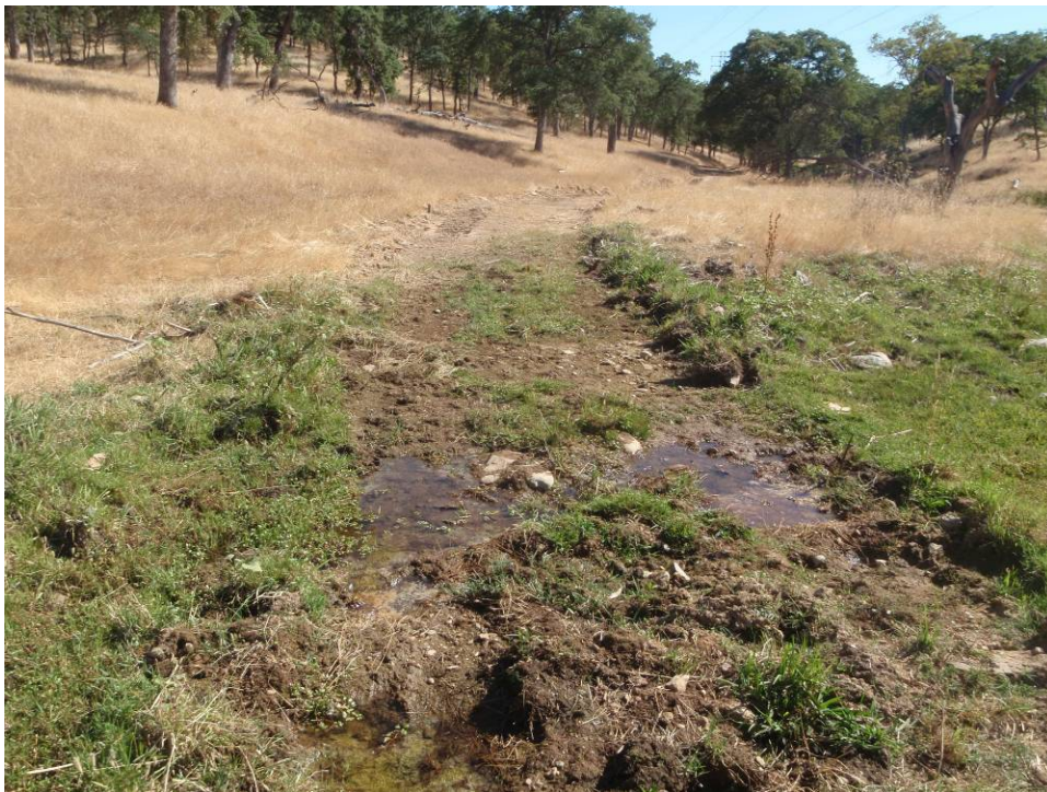
Photo 14. Big Creek The wetland is heavily influenced by cattle, as evident by grazed herbs and hoof puncture. Vehicles cross the wetland perpendicularly with no evidence of adverse effects on the wetland.