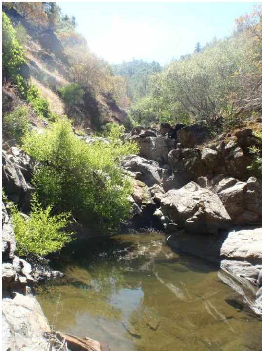
Photo 18. Deer Creek The landscape near the channel alternates between nearly barren areas of open bedrock and lower-gradient portions that support shrubs. Bedrock pools are present throughout the channel and support macroinvertebrates, crawfish, and bullfrogs ( Rana catesbiana )