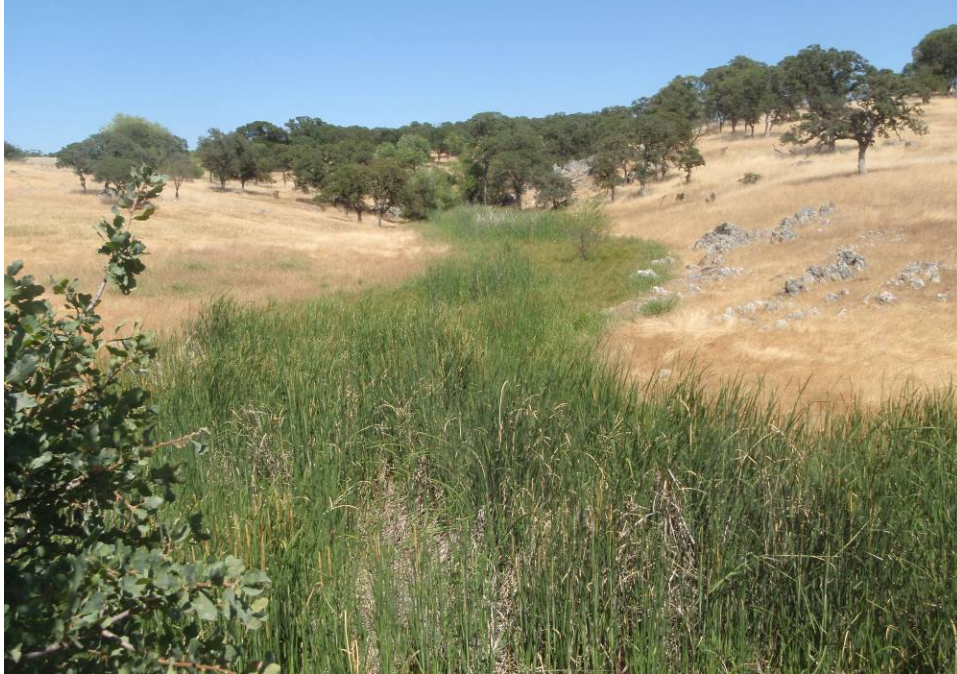
Photo 13. Big Creek The Big Creek channel had no distinct bed or banks and consisted of a shallow depression formed by hillslopes converging. The creek supported primarily herbaceous species, such as broad-leaved cattail ( Typha latifolia ), tall flatsedge ( Cyperus eragrostis ), annual beard grass, dallisgrass ( Paspalum dilatatum ), spike rush ( Eleocharis ovata ), and lady's thumb ( Persicaria maculosa ).