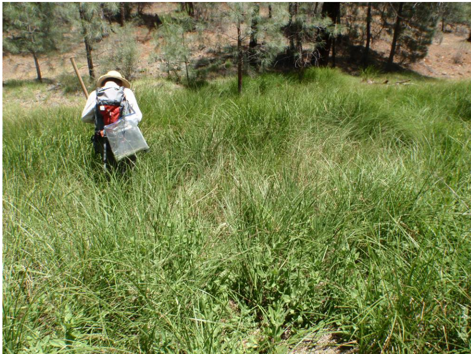
Photo 4. Poorman's Gulch Shallow soils overlay bedrock substrates, with hummocks of naked sedge and mixed herbs.