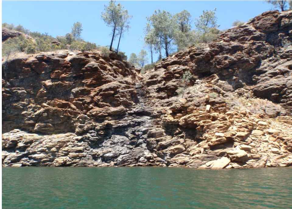
Photo 7. Three Springs Gulch Reconnaissance efforts using aerial photography and boat survey indicated that wetlands are not supported by Three Springs Gulch within or near the Project Boundary.