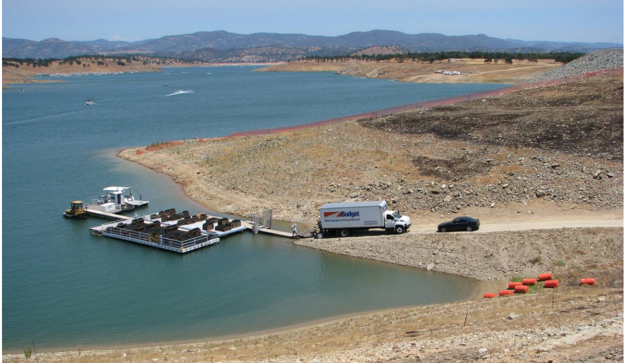
Figure 37. SPP 3. View at low reservoir elevation condition from a cove along the Don Pedro Reservoir shoreline looking east towards the dam.