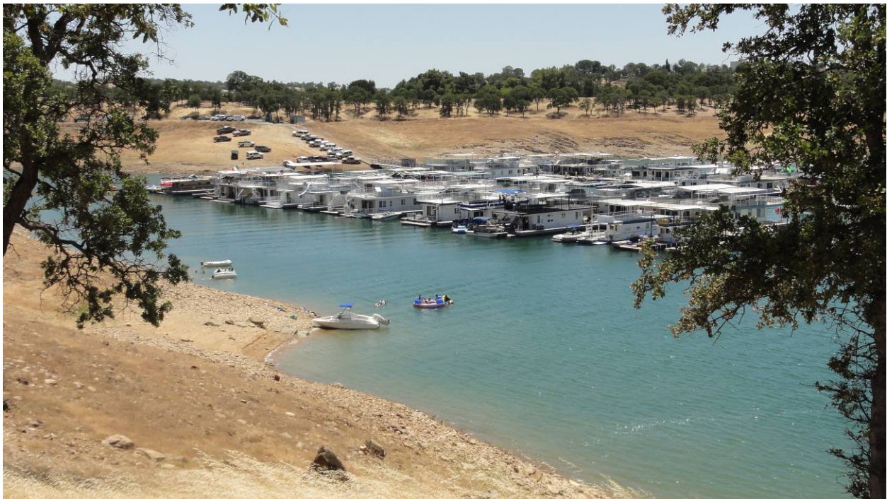
Figure 18. KOP 8. View from campsite A-47D on the point of Fleming Meadows Recreation Area looking southwest to houseboat marina on Don Pedro Reservoir. (July 2012)