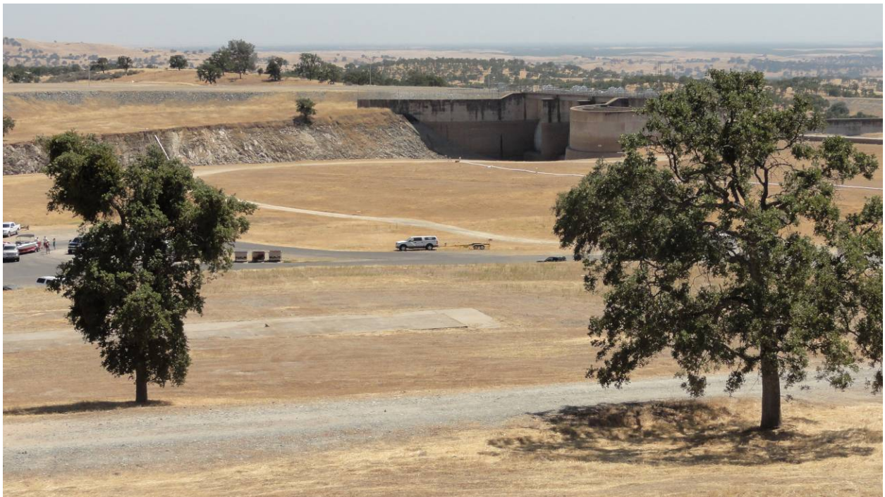
Figure 28. KOP 12. View southwest to the Don Pedro Spillway from Picnic Pavilion at Blue Oaks Recreation Area. (July 2012)