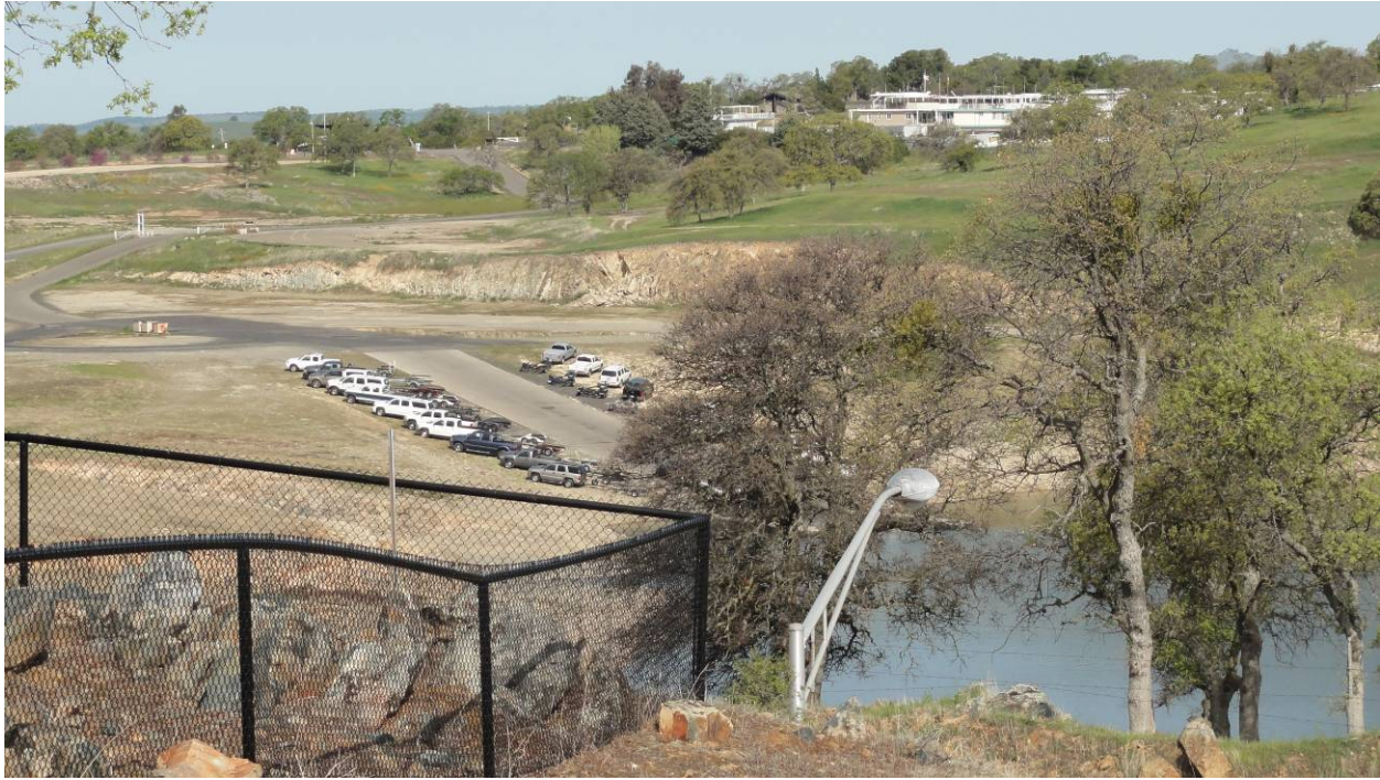
Figure 23. KOP 10. View from Don Pedro Recreation Agency Headquarters and Visitors Center looking north to Blue Oaks Recreation Area Boat Launch. (March 2012)