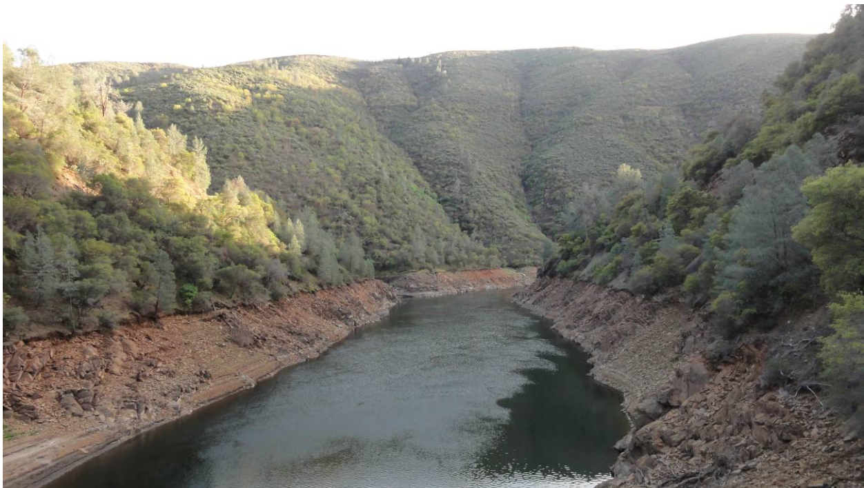
Figure 3. KOP 1. View from Ward's Ferry Bridge looking upriver. (March 2012)