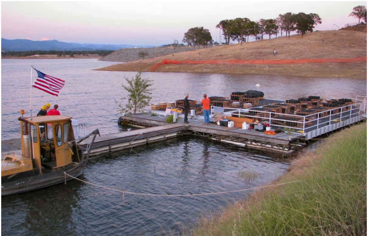
Figure 36. SPP 2. View at high reservoir elevation condition from a cove along the Don Pedro Reservoir shoreline looking east towards the dam.