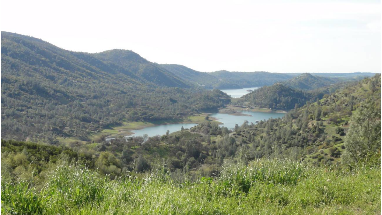
Figure 5. KOP 2. View across Don Pedro Reservoir from the intersection of Grizzly Road and New Priest Grade Road. (March 2012)