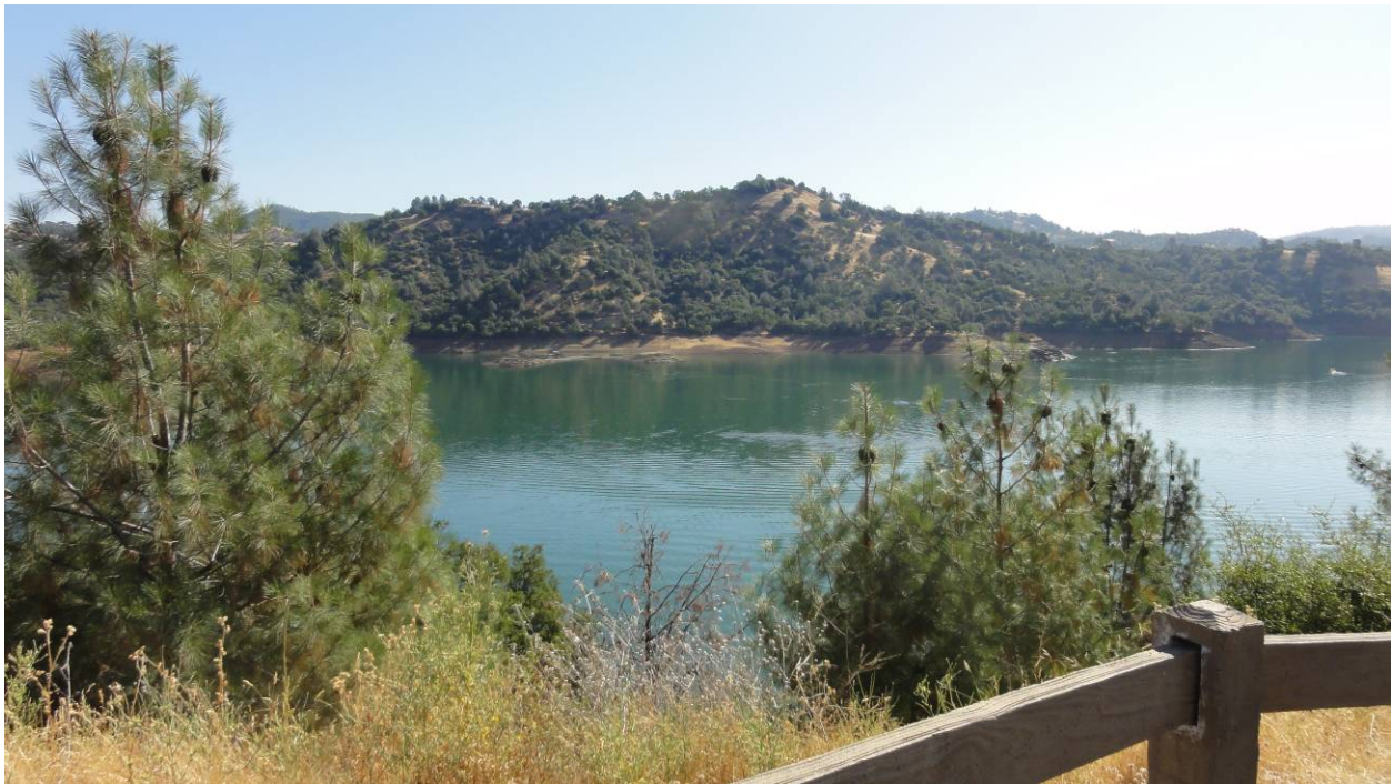
Figure 14. KOP 6. View of Don Pedro Reservoir from Highway 49/120 Vista Point. (July 2012)