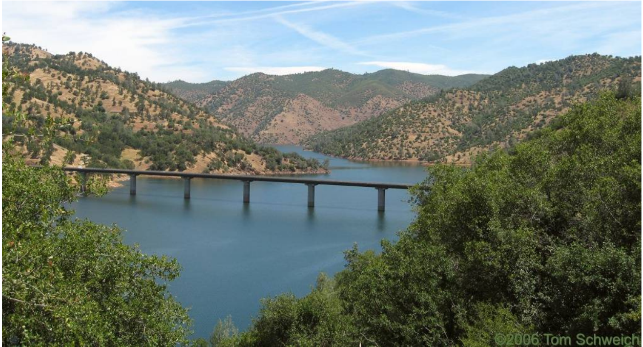
Figure 35. SPP 1. View depicting high reservoir elevation condition taken from the Highway 49/120 Vista Point looking east towards the Jacksonville Road Bridge.