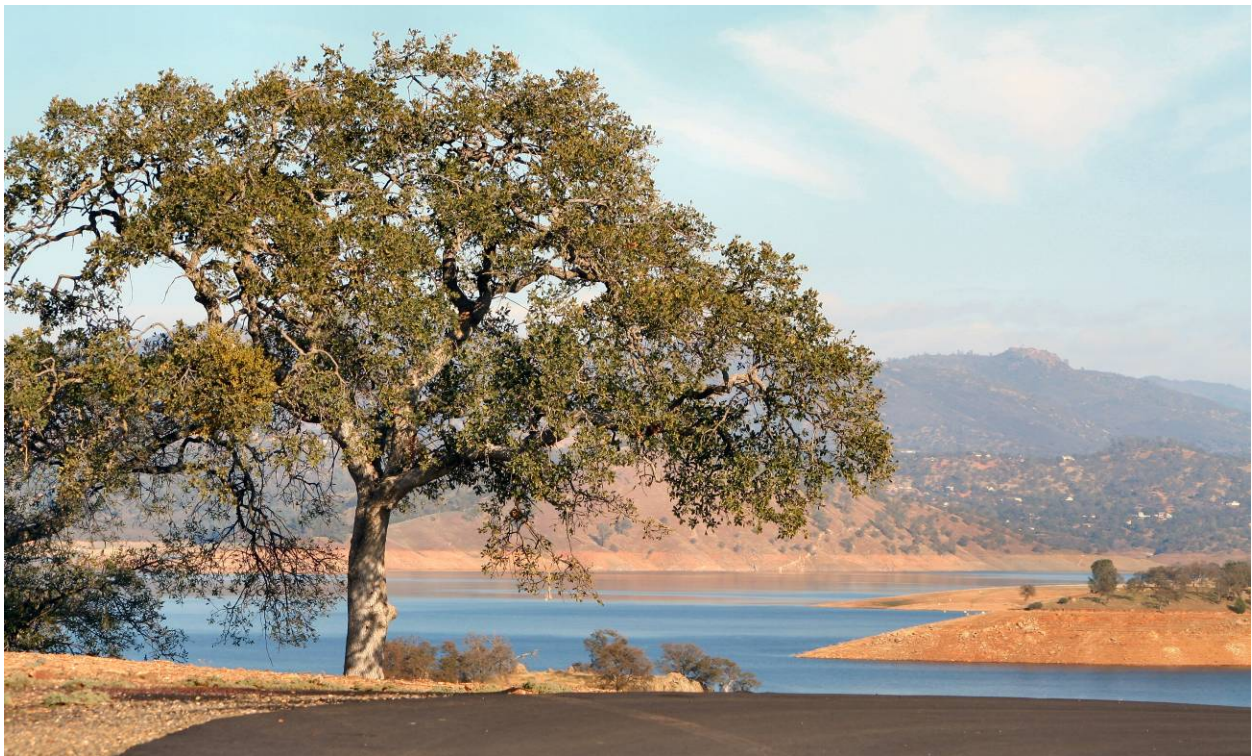
Figure 38. SPP 4. View depicting low reservoir elevation condition taken from the Blue Oaks Recreation Area looking east towards Don Pedro Reservoir.