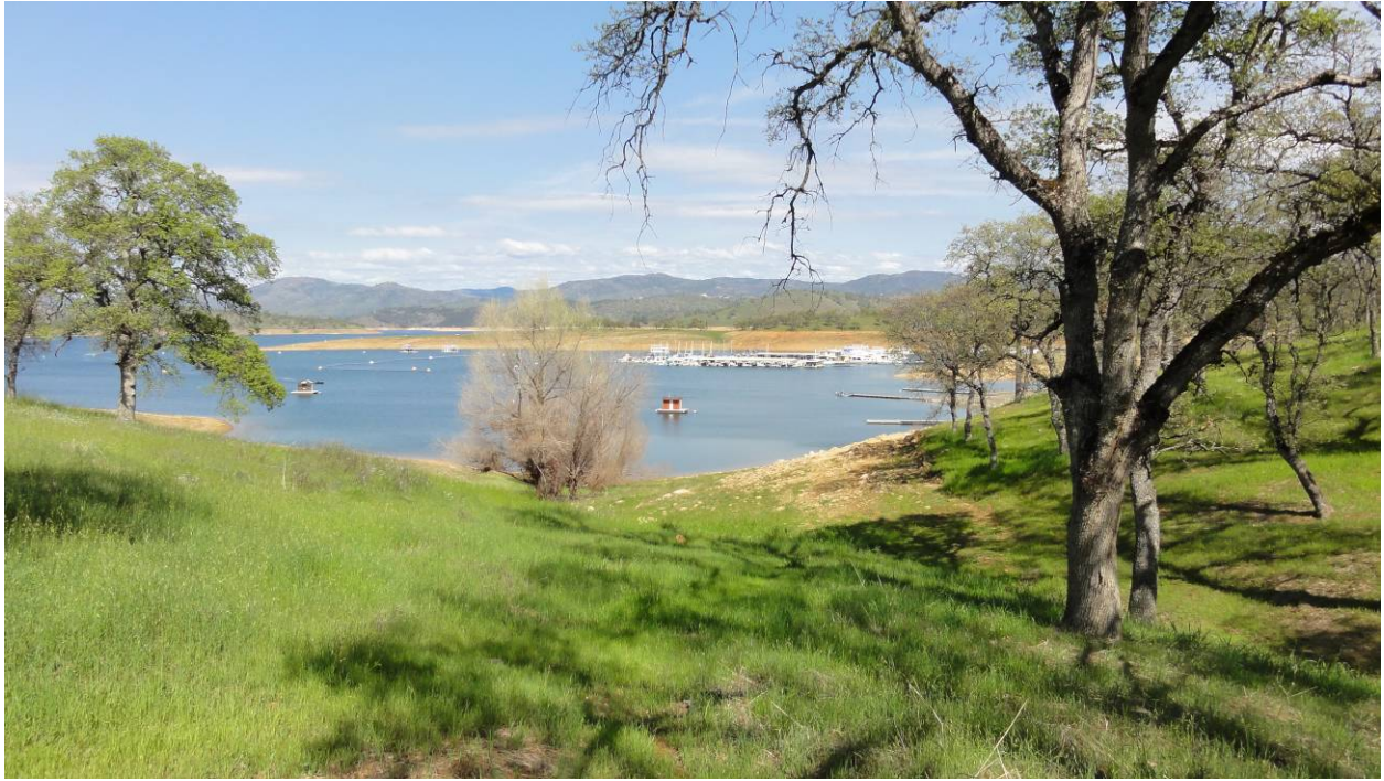
Figure 15. KOP 7. View from campsite A19 at Fleming Meadows Recreation Area looking east at Don Pedro Reservoir and houseboat marina. (March 2012)