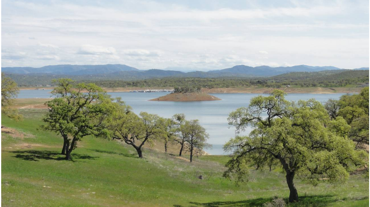
Figure 29. KOP 13. View from campsite B-40 in Blue Oaks Recreation Area looking east to island in middle ground and houseboats in background. (March 2012)