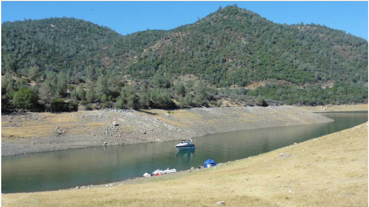
Figure 10. KOP 4. View looking southwest of Don Pedro Reservoir from just off of Kanaka Road. (July 2012)