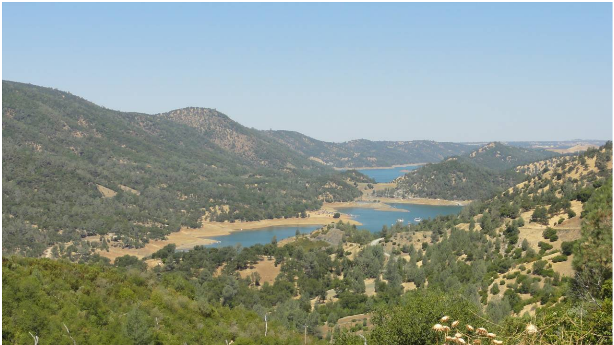
Figure 6. KOP 2. View across Don Pedro Reservoir from the intersection of Grizzly Road and New Priest Grade Road. (July 2012)