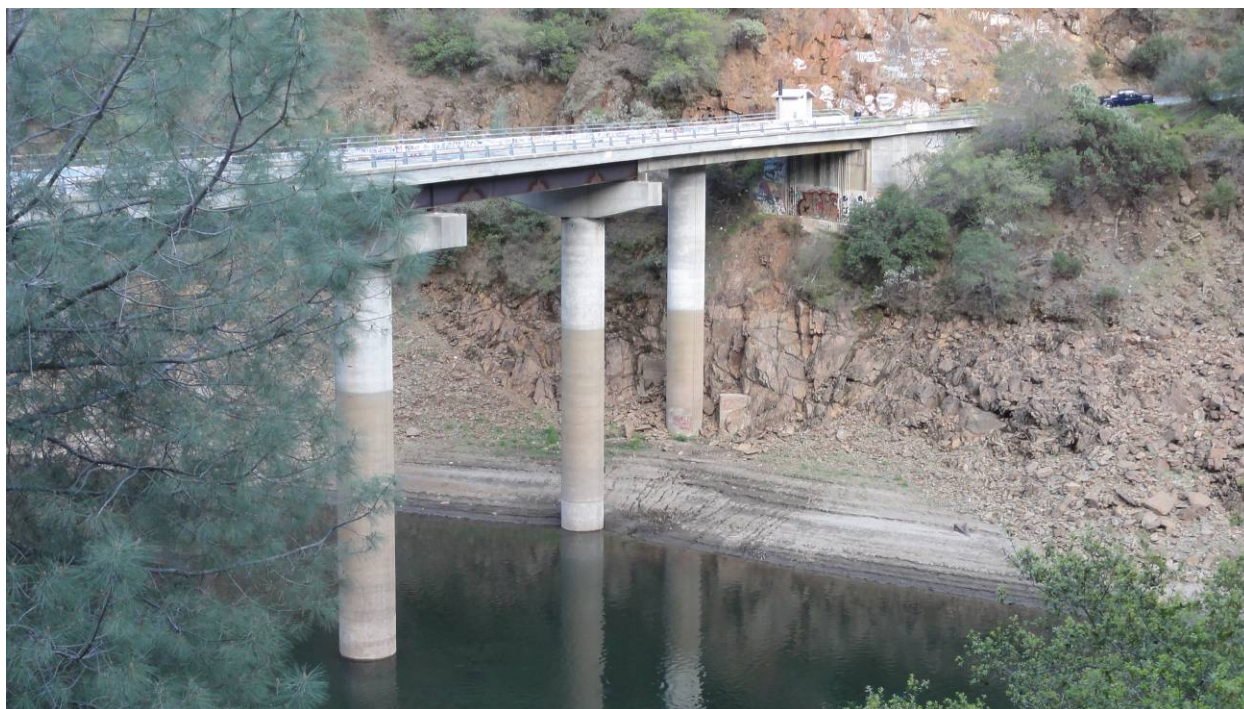
Figure 1. KOP 1. View of Ward's Ferry Bridge from Ward's Ferry Road. (March 2012)