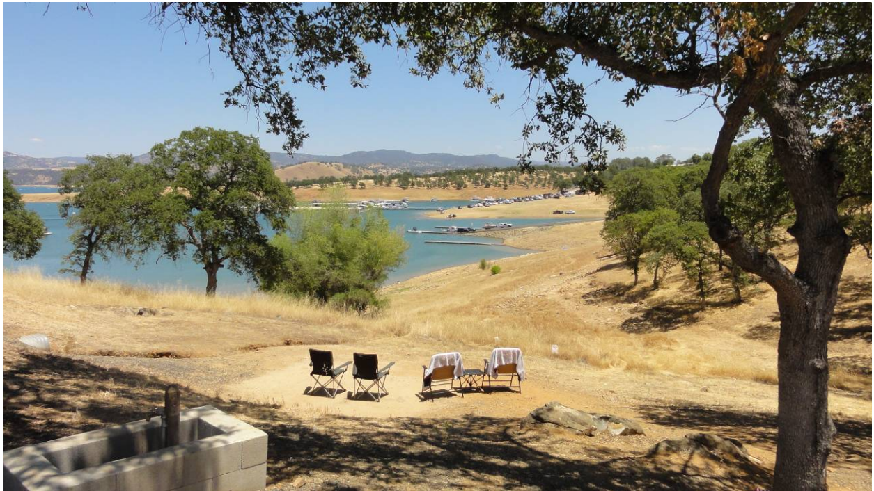
Figure 16. KOP 7. View from campsite A19 at Fleming Meadows Recreation Area looking east at Don Pedro Reservoir and houseboat marina. (July 2012)