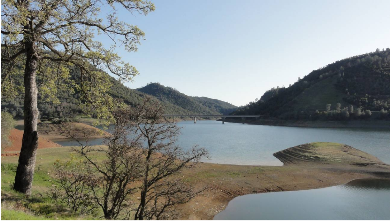
Figure 11. KOP 5. View from a dispersed recreation area off Harney Road looking southeast over Don Pedro Reservoir in middle ground with the Jacksonville Road Bridge and the Highway 49/120 Vista Point in the background. (March 2012)