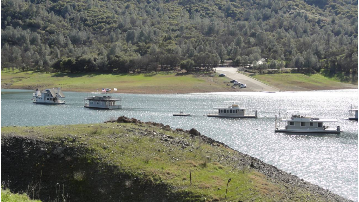
Figure 7. KOP 3. View from the end of Grizzly Road of houseboats and Moccasin Point Recreation Area boat ramp. (March 2012)