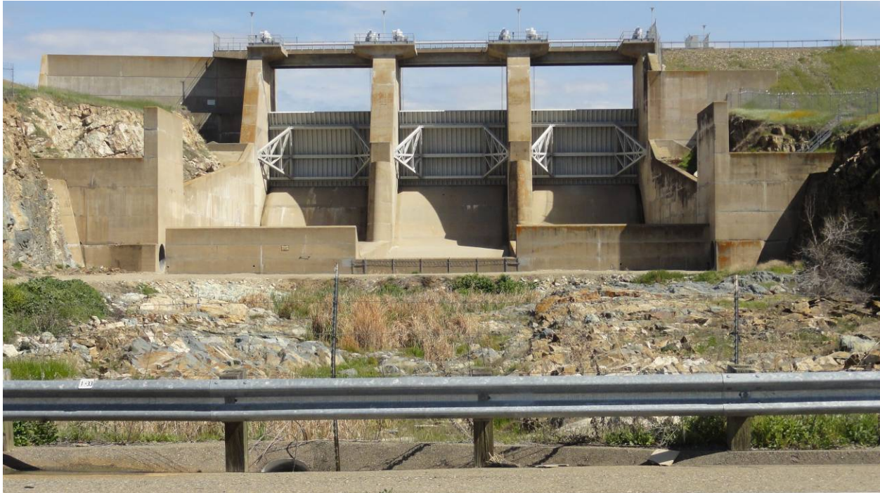
Figure 25. KOP 11. View east of Don Pedro Spillway from Bond Flats Road. (March 2012)