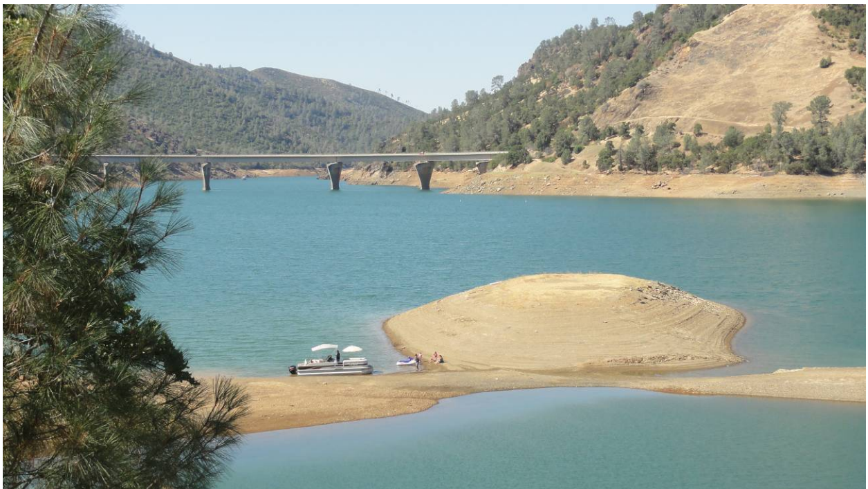
Figure 12. KOP 5. View from a dispersed recreation area off Harney Road looking southeast over Don Pedro Reservoir in middle ground with the Jacksonville Road Bridge and the Highway 49/120 Vista Point in the background. (July 2012)