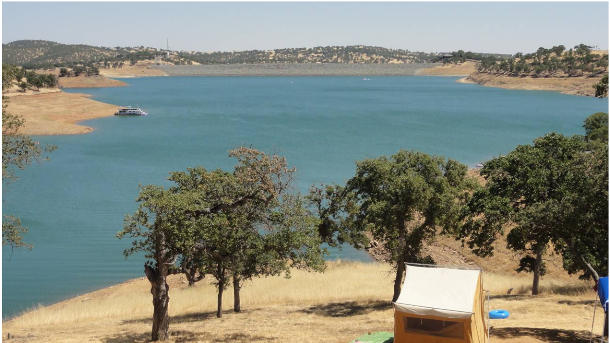
Figure 32. KOP 14 View from campsite D-19 at Blue Oaks Recreation Area looking east at Don Pedro Reservoir and Don Pedro Dam. (July 2012)