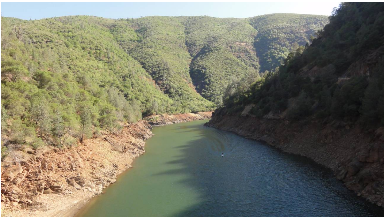
Figure 4. KOP 1. View from Ward's Ferry Bridge looking upriver. (July 2012)