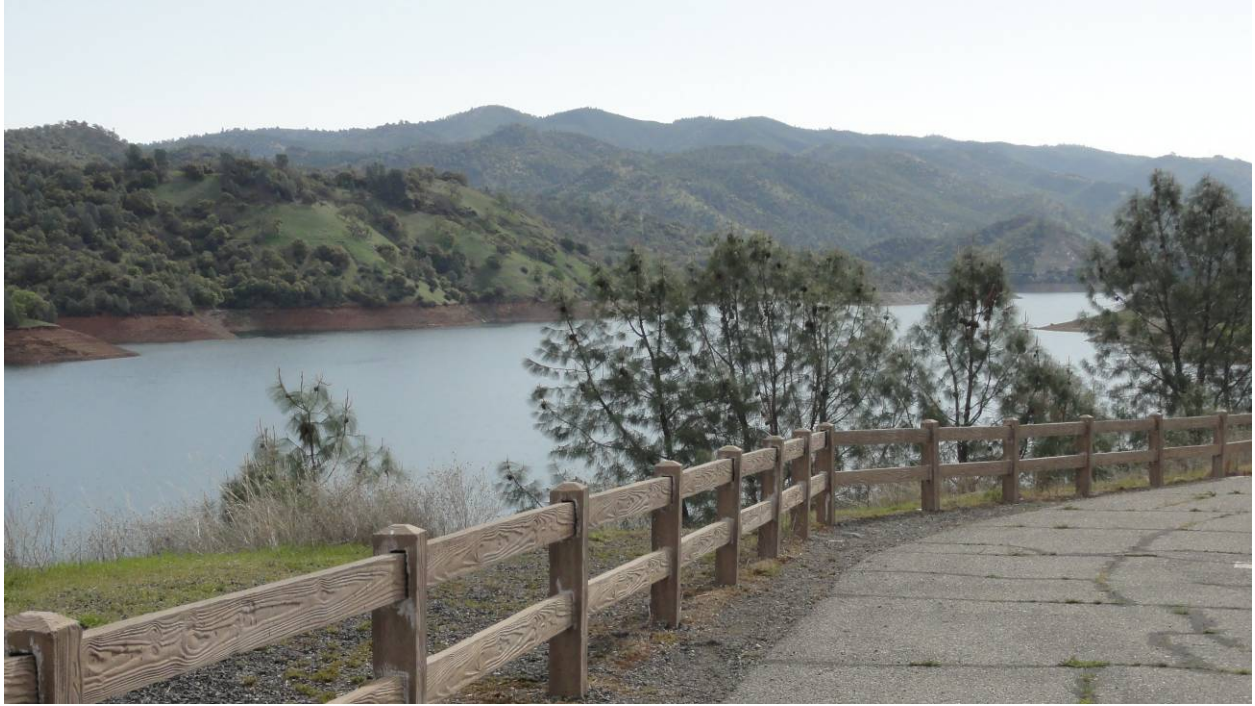
Figure 13. KOP 6. View of Don Pedro Reservoir from Highway 49/120 Vista Point. (March 2012)