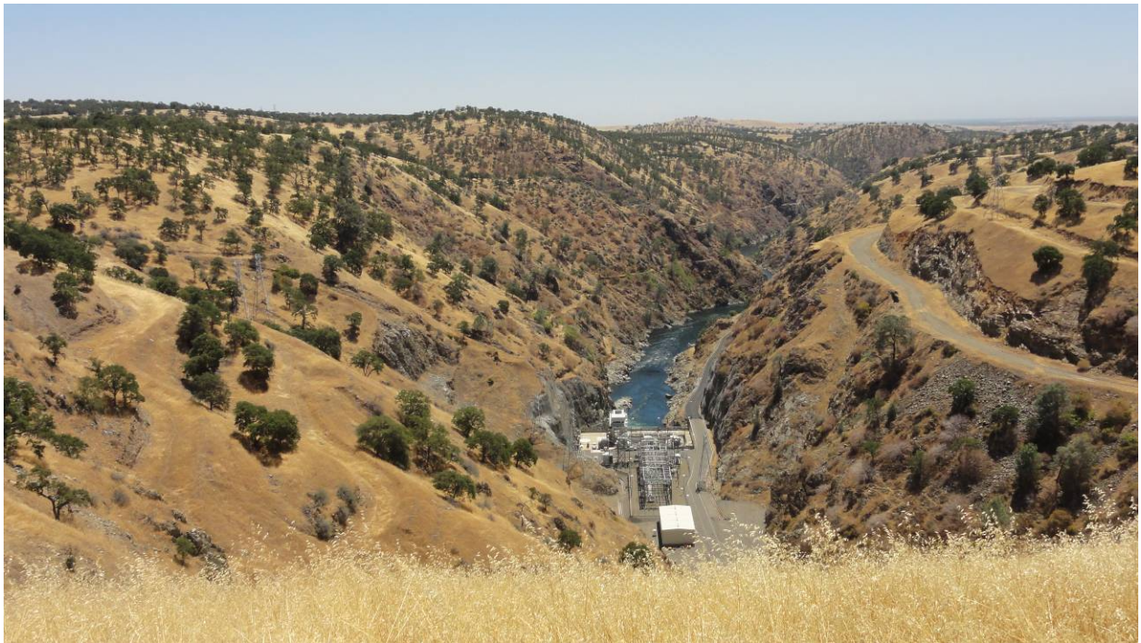
Figure 20. KOP 9. View south of powerhouse from Bonds Flat Road. Picture is taken from the passenger window at the center of the dam road. The powerhouse is located at the bottom of the canyon and is in the middle ground. (July 2012)