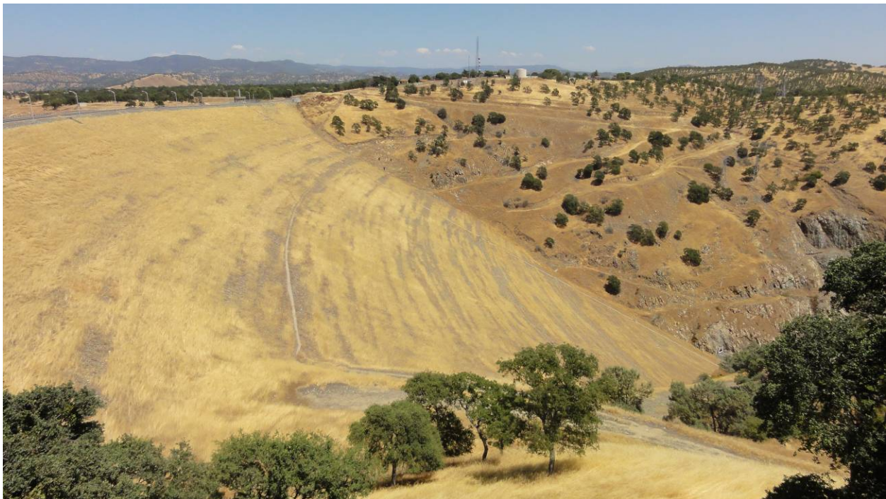
Figure 22. KOP 10. View east towards the Don Pedro Dam from Don Pedro Recreation Agency Headquarters and Visitors Center. (July 2012)