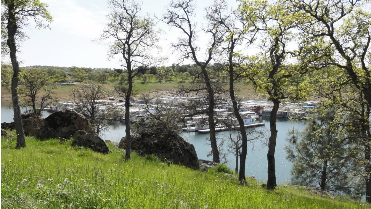
Figure 17. KOP 8. View is from campsite A-47D on the point of Fleming Meadows Recreation Area looking southwest to houseboat marina on Don Pedro Reservoir. (March 2012)