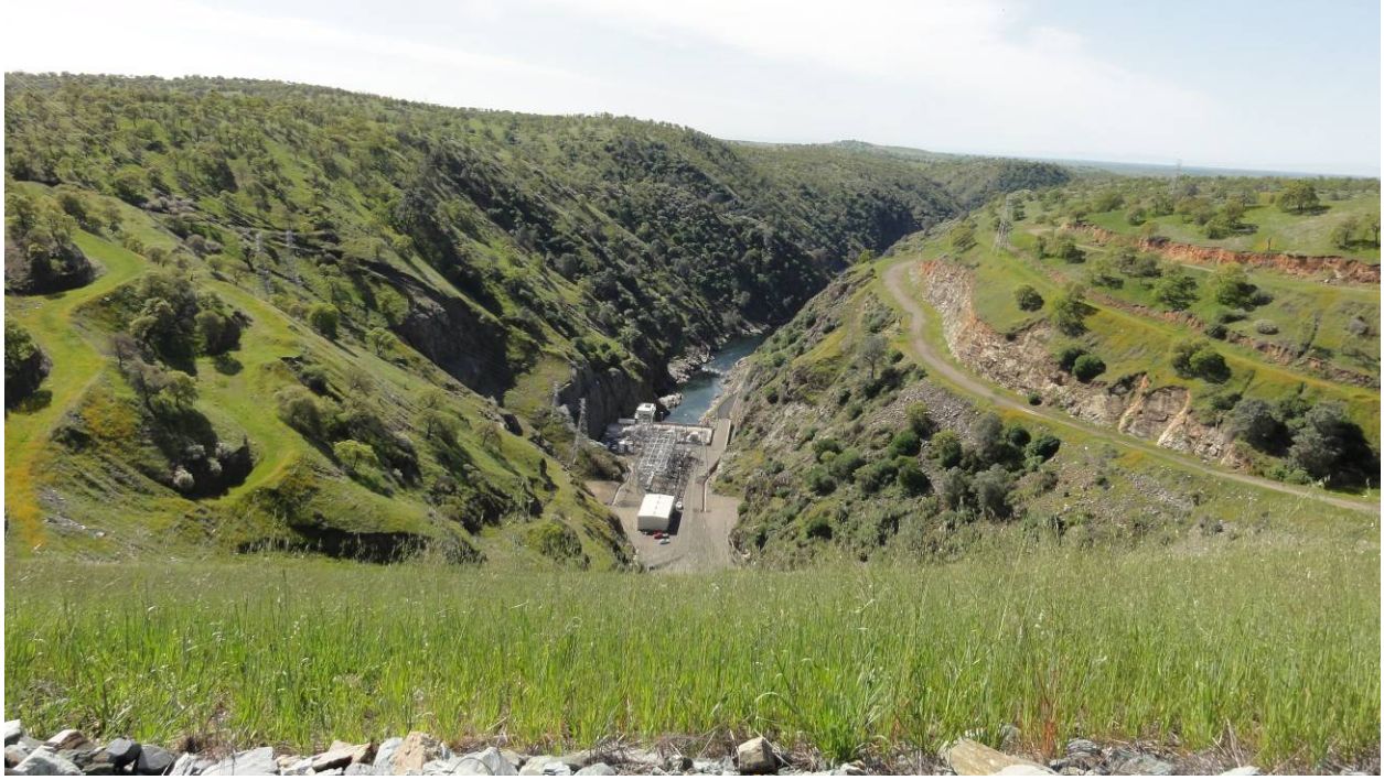
Figure 19. KOP 9. View south of powerhouse from Bonds Flat Road. Picture is taken from the vehicle passenger window at the center of the dam road. The powerhouse is located at the bottom of the canyon and is in the middle ground. (March 2012)