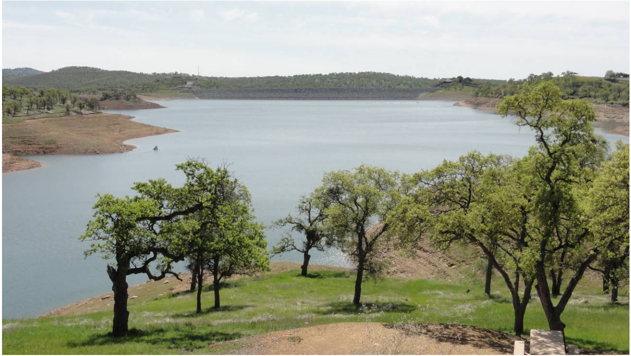
Figure 31. KOP 14 View from campsite D-19 at Blue Oaks Recreation Area looking east at Don Pedro Reservoir and Don Pedro Dam. (March 2012)