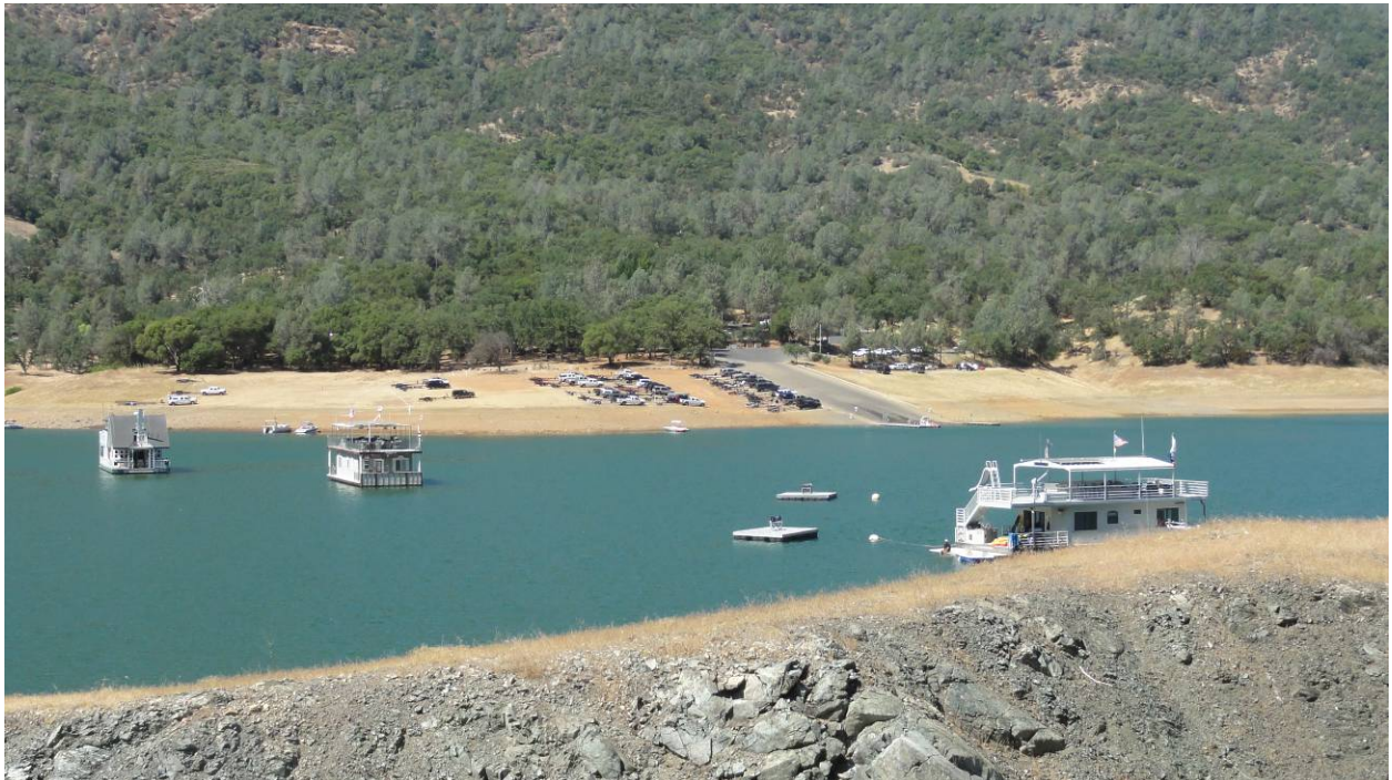
Figure 8. KOP 3. View from the end of Grizzly Road of houseboats and Moccasin Point Recreation Area boat ramp. (July 2012)