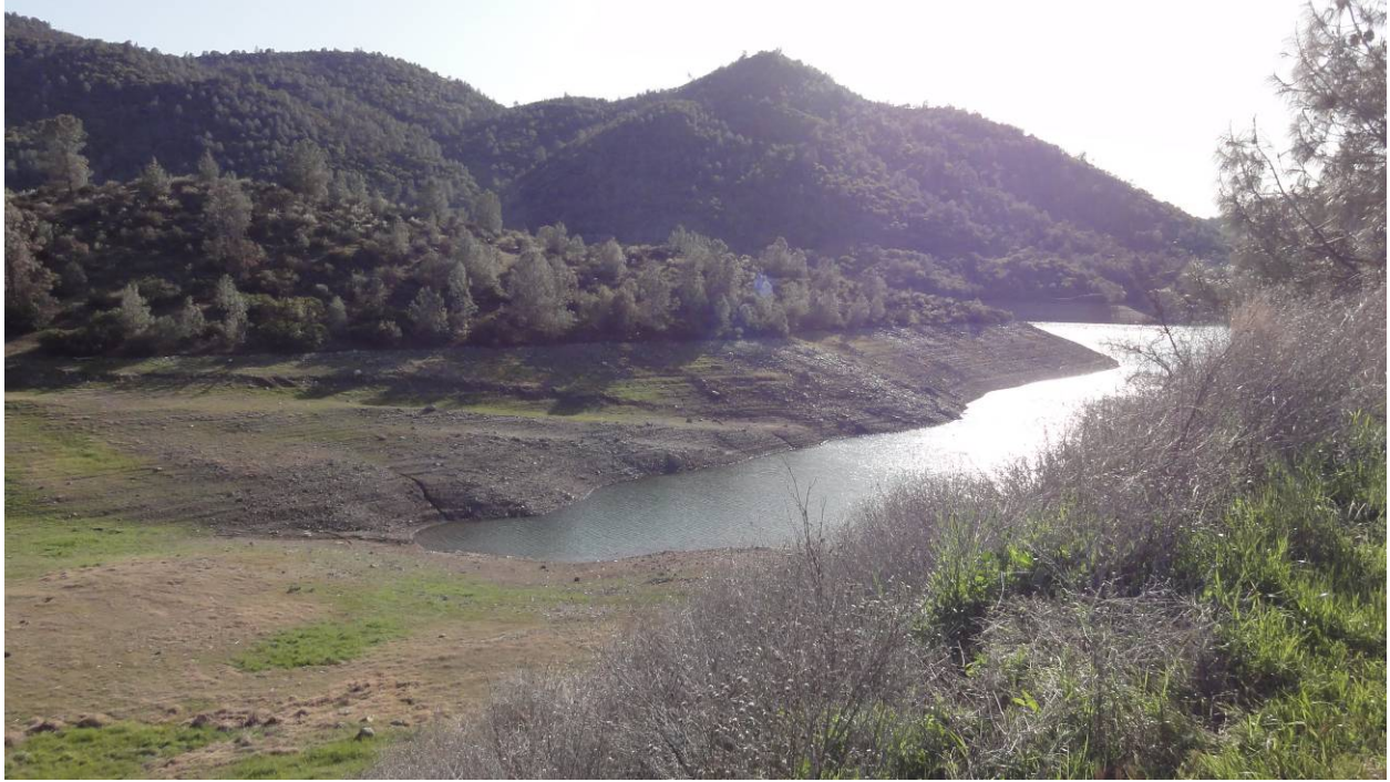
Figure 9. KOP 4. View looking southwest of Don Pedro Reservoir from just off of Kanaka Road. (March 2012)