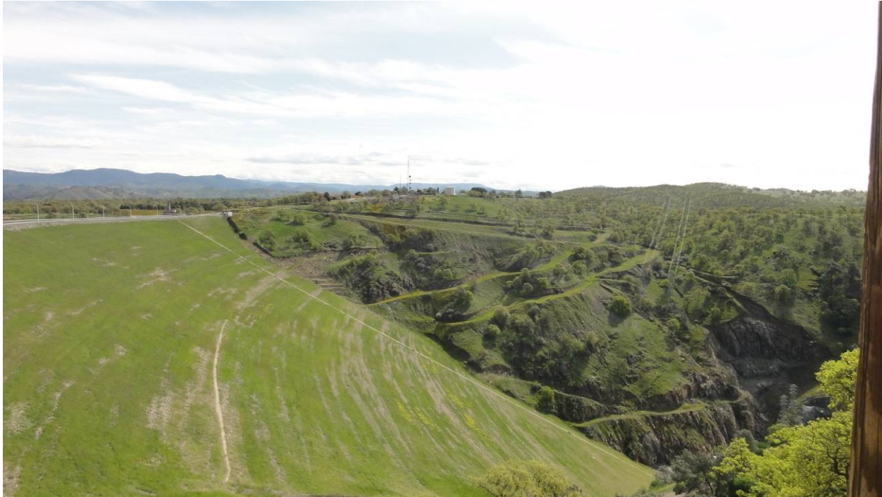
Figure 21. KOP 10. View east towards the Don Pedro Dam from Don Pedro Recreation Agency Headquarters and Visitors Center. (March 2012)