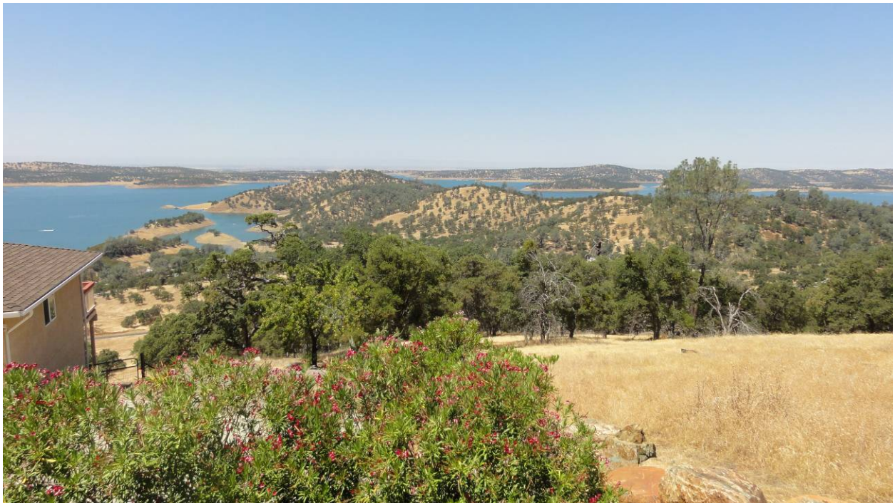
Figure 34. PP 1. View from Arbolado Drive looking west towards Don Pedro Reservoir. (July 2012)