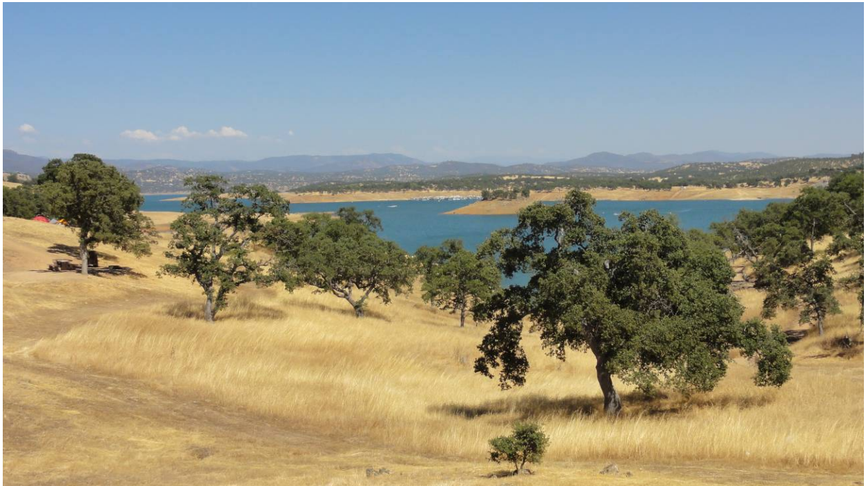
Figure 30. KOP 13. View from campsite B-40 in Blue Oaks Recreation Area looking east to island in middle ground and houseboats in background. (July 2012)