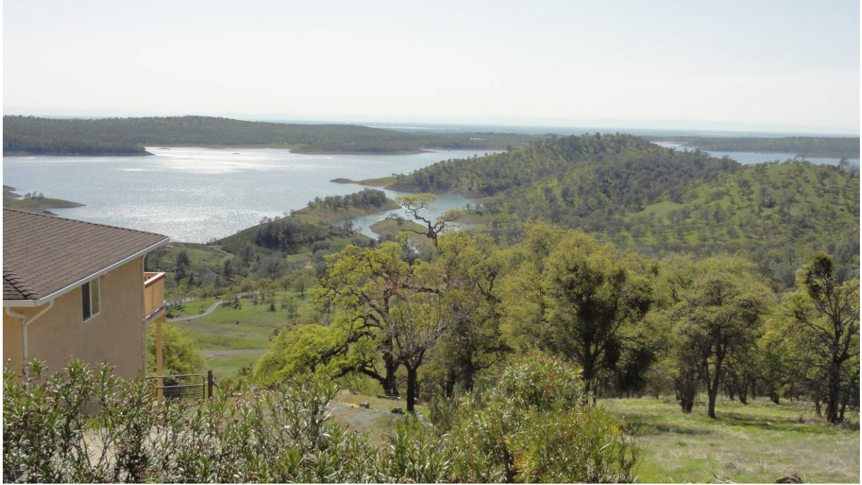
Figure 33. PP 1. View from Arbolado Drive looking west towards Don Pedro Reservoir. (March 2012)