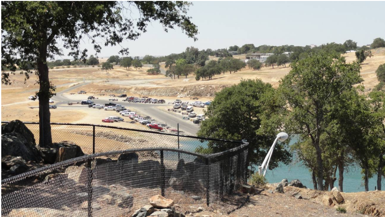
Figure 24. KOP 10. View from Don Pedro Recreation Agency Headquarters and Visitors Center looking north toward Blue Oaks Recreation Area Boat Launch. (July 2012)