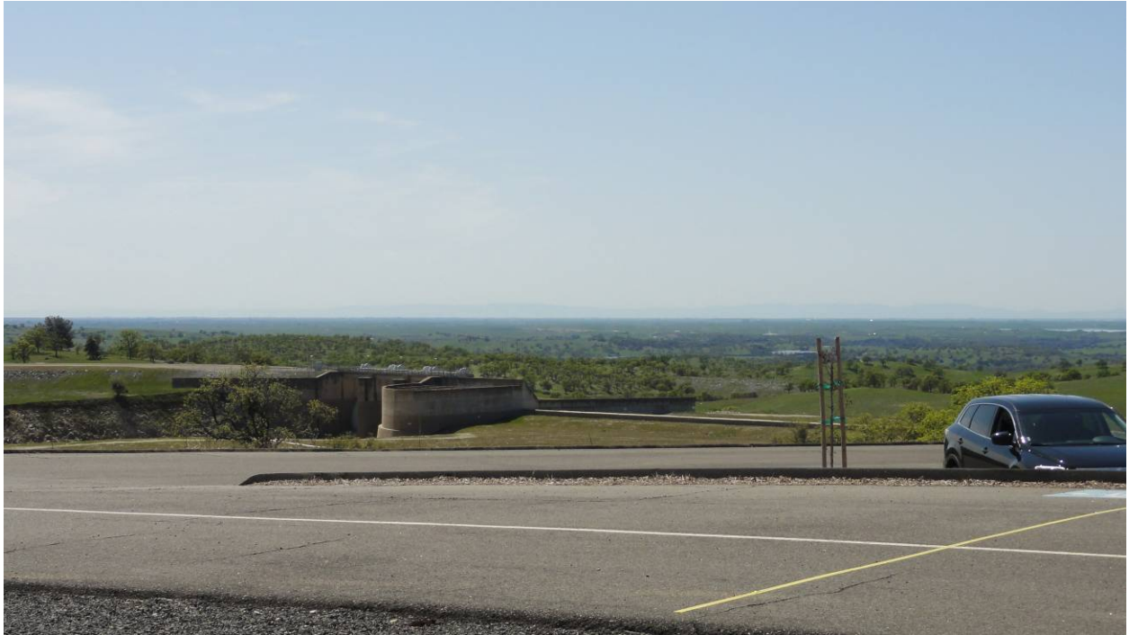
Figure 27. KOP 12. View southwest to the Don Pedro Spillway from Picnic Pavilion at Blue Oaks Recreation Area. (March 2012)