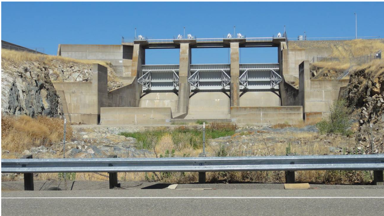
Figure 26. KOP 11. View east of Don Pedro Spillway from Bond Flats Road. (July 2012)