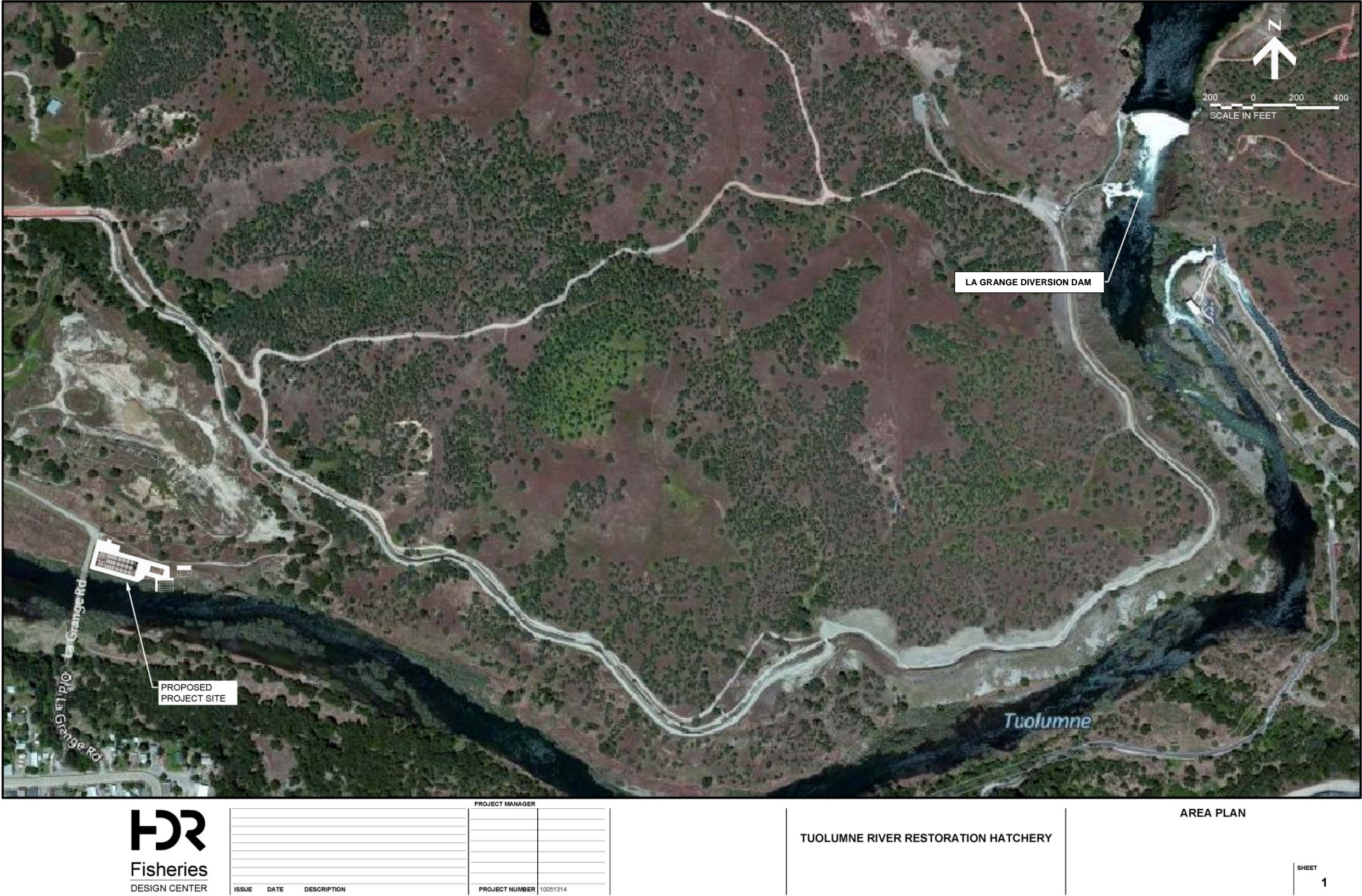
Figure 1.1-1. Tuolumne River restoration hatchery – area plan.