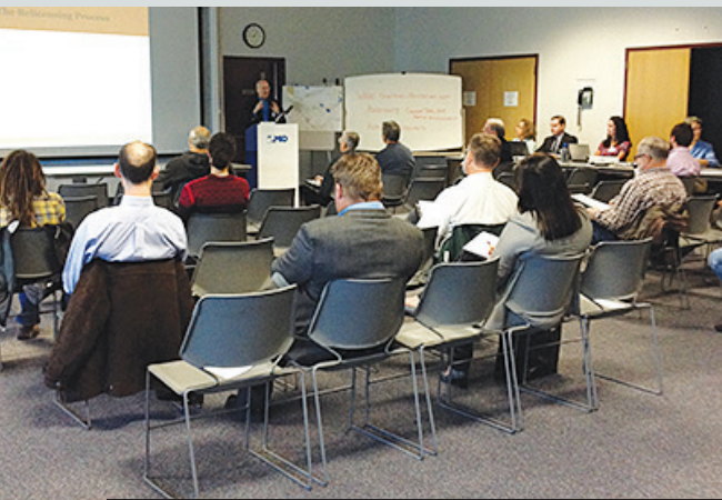
On Jan. 16, 2014, the Districts held a public meeting at the MID office to present and discuss the USR.