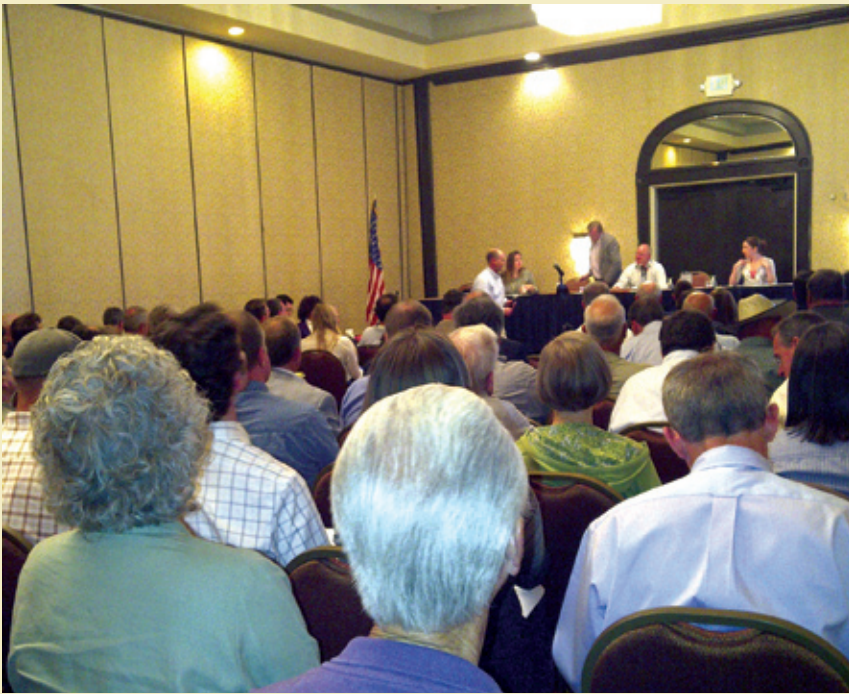
Scoping meetings in Modesto (above) and Turlock attracted over a hundred people.