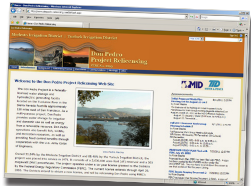
A screenshot of www.donpedro-relicensing.com

The website serves as one of the primary communication outlets informing stakeholders of events and meetings that are part of the relicensing process.