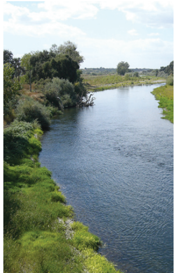
Studies involving water temperature and dissolved oxygen data at the discharge from the Don Pedro Powerhouse are being conducted. Here, the river is shown downstream of the powerhouse.